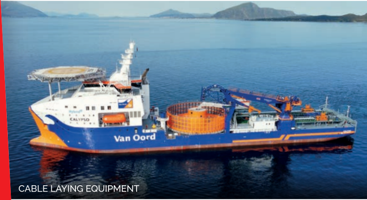
CABLE LAYING EQUIPMENT