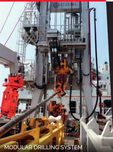
MODULAR DRILLING SYSTEM